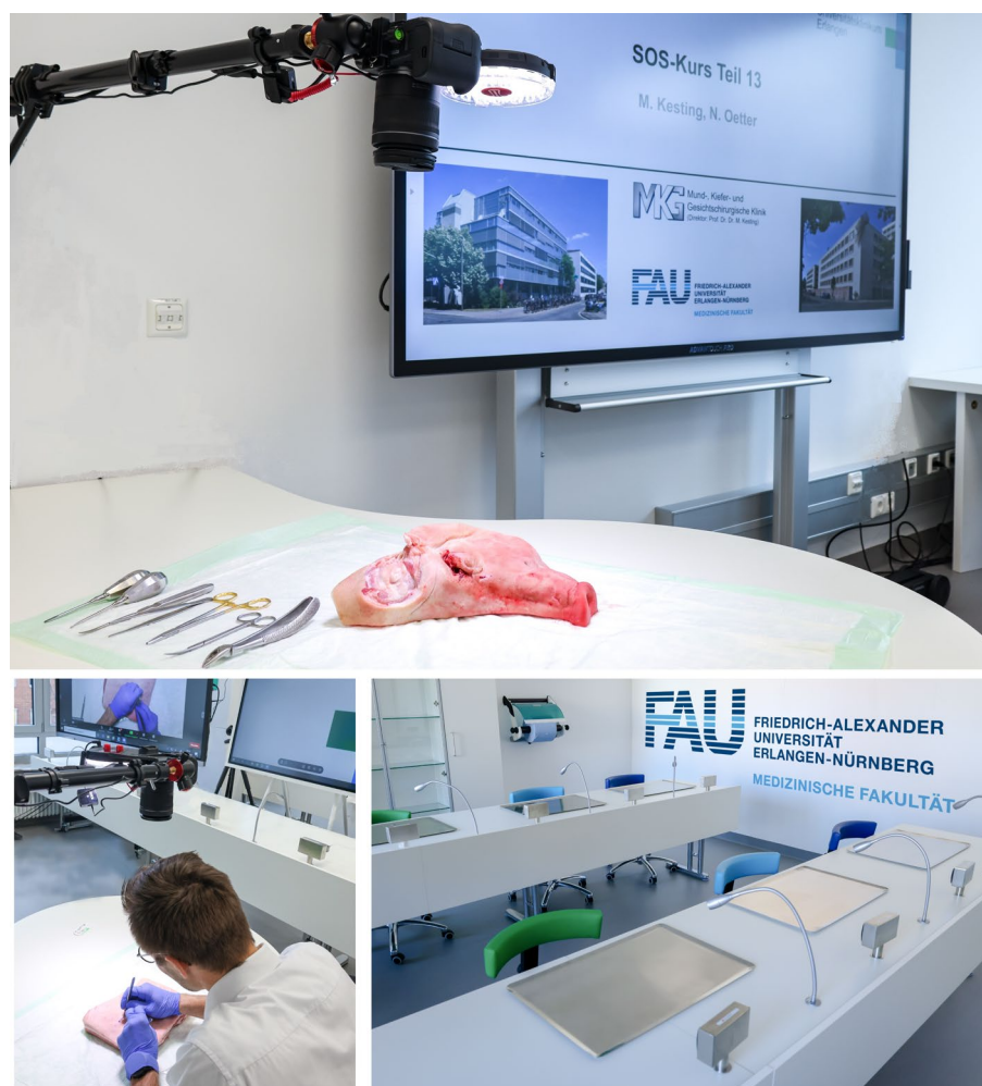
Fig. 3 “Skills Lab” of the Department of Oral and Cranio-Maxillofacial Surgery, Friedrich-Alexander-Universität Erlangen-Nürnberg (FAU). Premises and technical equipment/setup for executing the SOS Course

a period of four weeks (a period of reflection) until the evaluation session was closed.