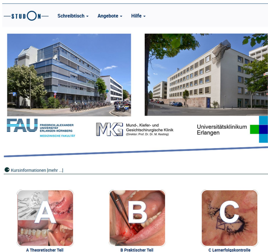
Fig. 1 Modular course structure of the SOS Course. Module A : Theoretical part; Module B : Practical part with live online sessions; Module C : Learning outcome

All students had to participate in two "Clinical Examinations" (CEs). The first was scheduled at the beginning, the second at the end of the semester/of the SOS Course (in particular, during sessions 2 and 13; see Table 1).