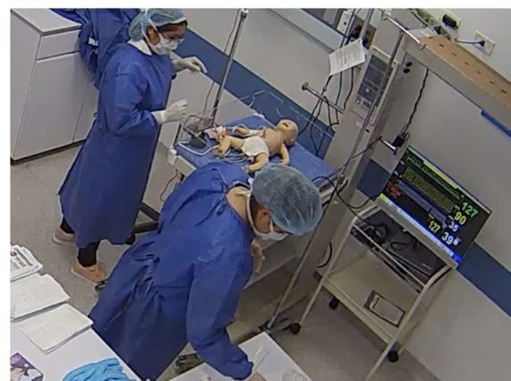
Fig. 3 simulated scenario

monitors and equipment for exchange transfusion. Figure 3 shows the simulated scenario.