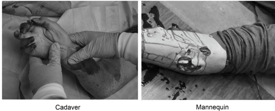
Fig. 1 Limb Injury (Cadaver vs. Mannequin)

variance were used, conducted with the use of the PAST 3.20 software. All results were considered statistically significant at p < 0.05 .