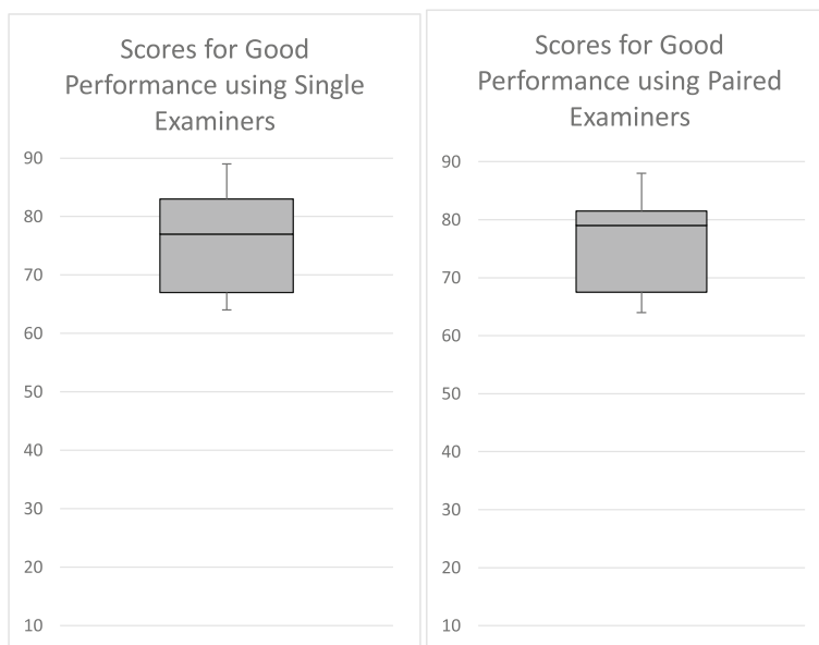
Fig. 3 Box and Whisker Plots showing the Variability of Overall Scores for the Good Performance using Single and Paired Examiners

We compared candidates scores when they were examined by 12 individual examiners with their scores when they were examined by 6 examiner pairs (see Table 1). The ‘good’ performance was awarded an honour by all