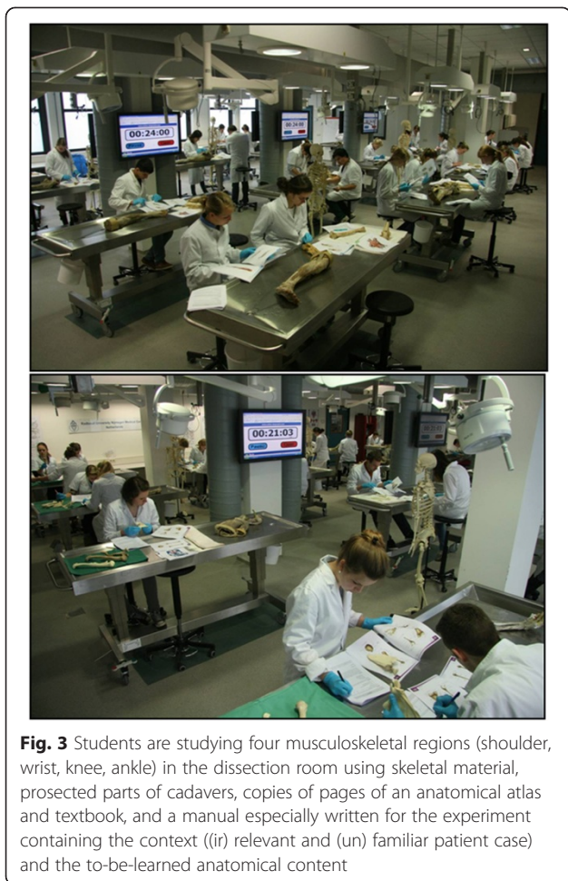
Fig. 3 Students are studying four musculoskeletal regions (shoulder, wrist, knee, ankle) in the dissection room using skeletal material, prosected parts of cadavers, copies of pages of an anatomical atlas and textbook, and a manual especially written for the experiment containing the context ((ir) relevant and (un) familiar patient case) and the to-be-learned anatomical content

without context’ (H1) could not be confirmed. Results even show an opposite effect ( \beta = -0.301 ). The hypothesis that ‘relevant context leads to better performance than irrelevant context’ (H2) is not supported convincingly, and the standardized beta ( \beta = 0.091 ) indicates a small effect (in the expected