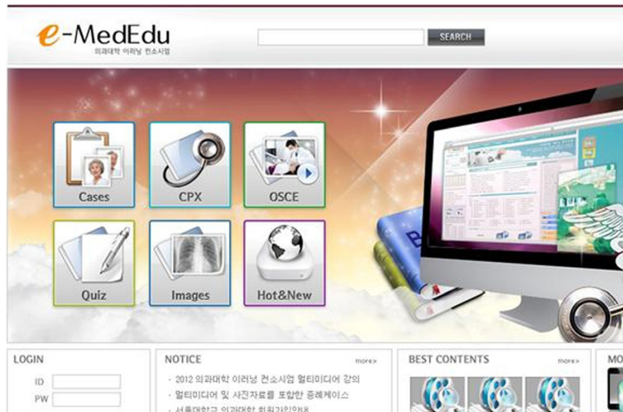
Figure 1 e-MedEdu home page ( www.mededu.or.kr ).

Data were collected throughout the academic year 2011–2012. IRB approval was not requested, because this study fell under the general exemption from our institutional review board for educational outcomes data.