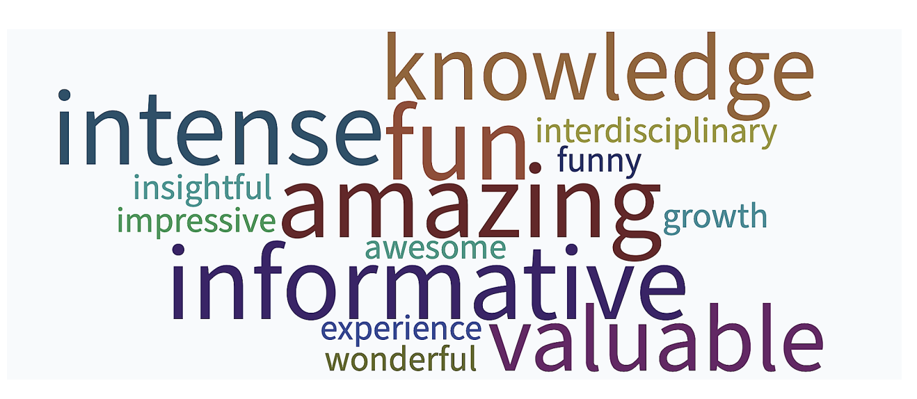
Fig. 3 The Al-pixelated feedback of workshops on Al in dentistry via ChatGPT and DALLE2 during the DentalOmics Blended Intensive Programme.

Duś-Ilnicka et al. BMC Medical Education (2024) 24:352 Page 8 of 10