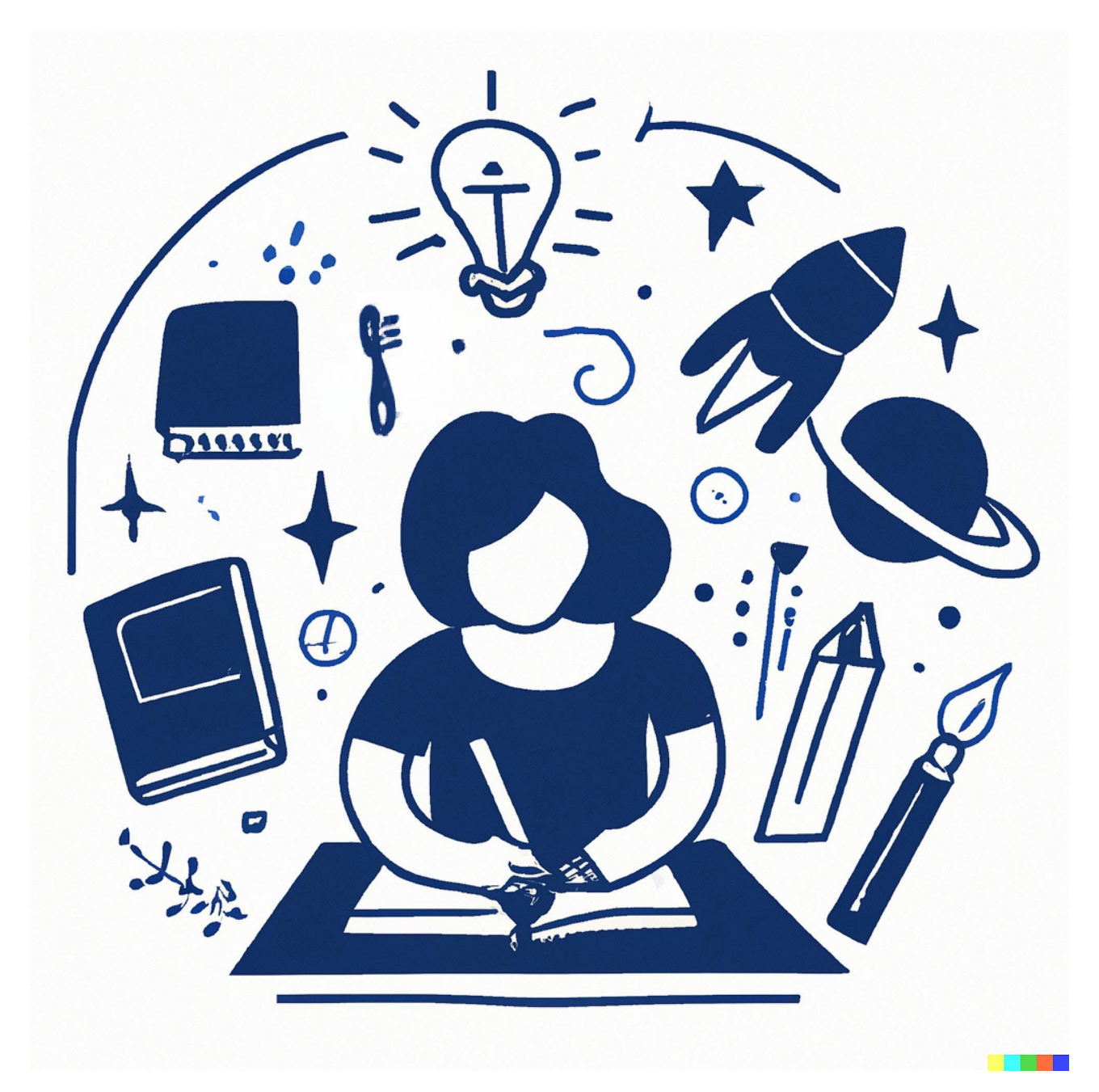
Fig. 2 The Al-pixelated feedback of workshops on Al in dentistry via ChatGPT and DALLE2 during the DentalOmics Blended Intensive Programme.

Duś-Ilnicka et al. BMC Medical Education (2024) 24:352 Page 7 of 10