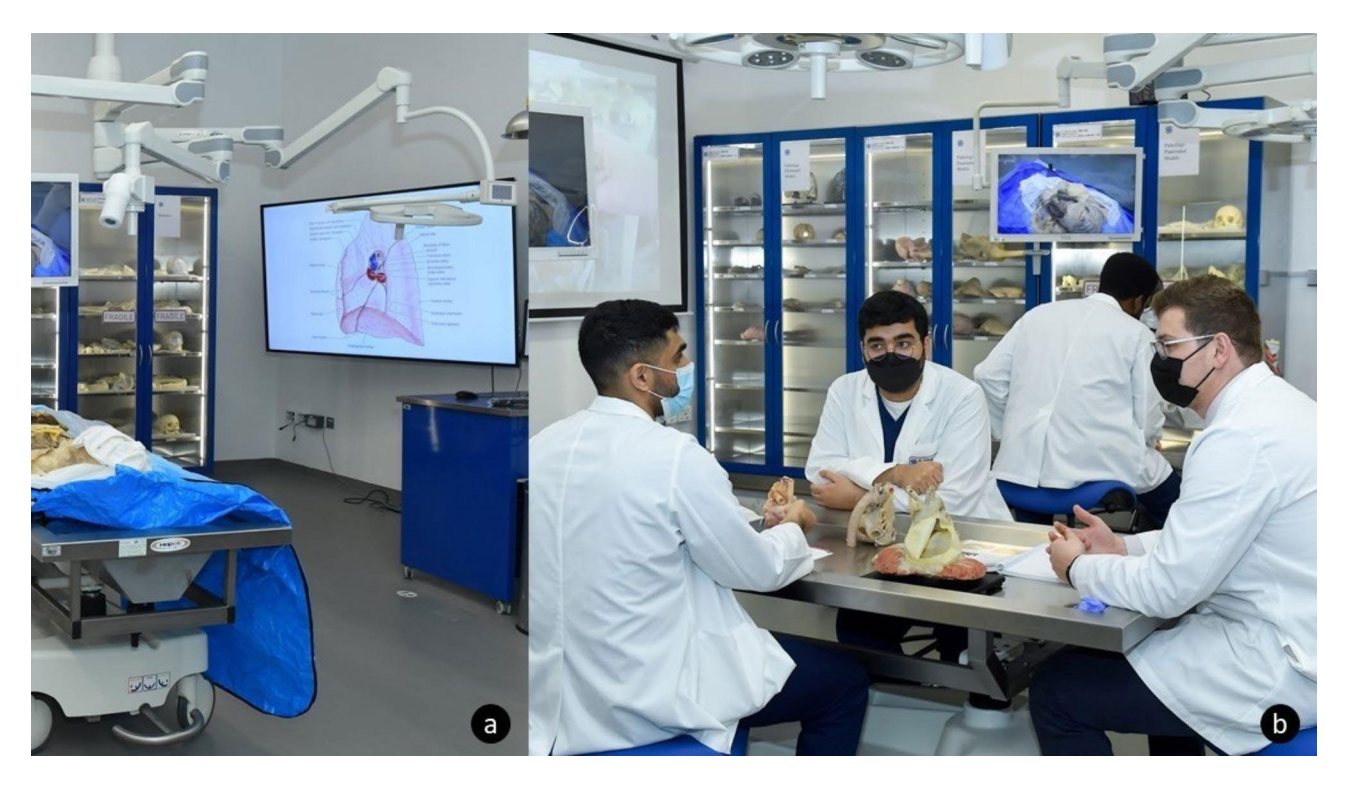
Fig. 3 Instructional Studio with: a. Mobile Mopec<sup>®</sup> Hydraulic Lift Dissection Table and attached ventilation system; b. Period two teaching session using von Hagens Plastination<sup>®</sup> specimens

SlideCenter<sup>®</sup> (©2021, 3DHISTECH Ltd., Budapest, Hungary) provided by 3DHistech<sup>®</sup> permits specimens to be examined remotely while a laboratory technician works on the cadaveric samples within the laboratory.