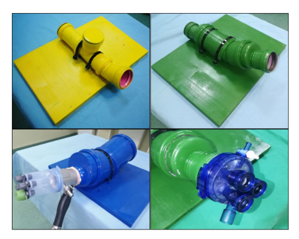
Fig. 1 The designed tubular systems. 5 cm diameter (yellow), 7.5 cm diameter (green) and 10 cm diameter (blue)

1 - Teddy bears - The objective is to grasp one gummy bear at a time, transfer it from one forceps to the other and then, place it in the plastic recipient.