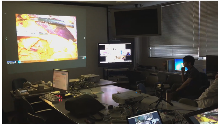
Fig. 2 Conference room at Saga University. Left monitor: Video of ES was played with surgeon's comment; Right monitor: View of the conference rooms at remote institutions

University and the developer Unixon Systems. Each institution was connected through commercial internet [21]. The interactive teleconferences involved recorded, uncut video with bidirectional discussion via JoinView and Vidyo (Fig. 1).