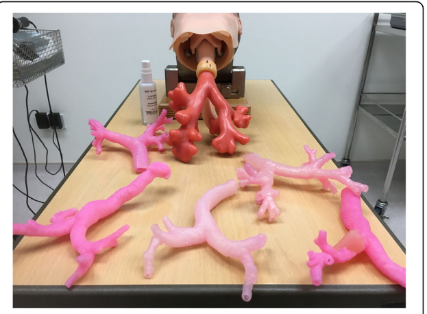
Fig. 2 Standard airway trainer, comprising detachable lower airway model attached to upper airway structures. Surrounding this are a series of 3D printed models derived from CT scans as described in the Methods section

A total of three models were printed; these were patientspecific, life-sized and assigned both colour and specific