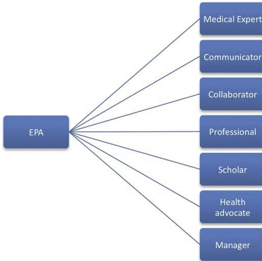
Figure 2 Relationship between an EPA and the underlying competencies.